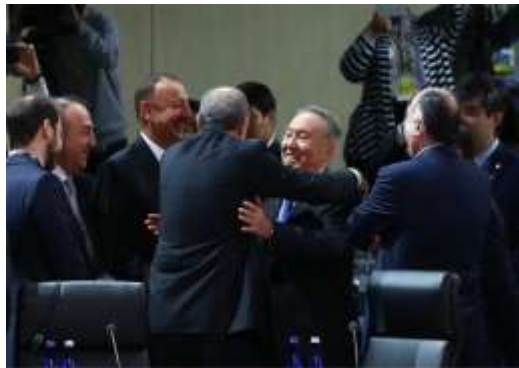
April 1, 4:30 PM Washington, DC

While in Washington as guests, presidents of Turkey and Azerbaijan were in a happy mood while their terrorists were starting to carry out their planned terrorist act on April 1 at 7:00 PM Washington time. See Photo.