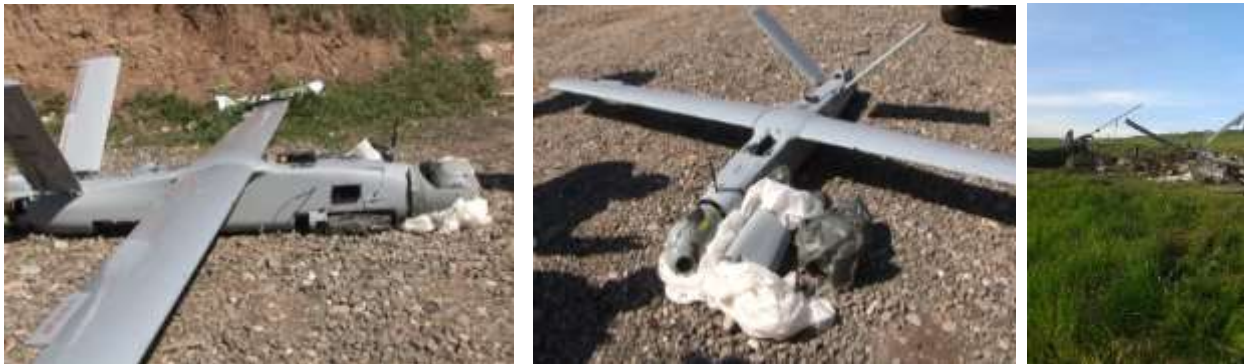
Azeri downed helicopters and drones

We express our solidarity with Presidents Sargsyan and Sahakian and the whole population of Artsakh. Most of all, we urge the United Nations Security Council to condemn this latest act of terrorism perpetuated by Rəcəp Erdoğan and İlham Əliyev.