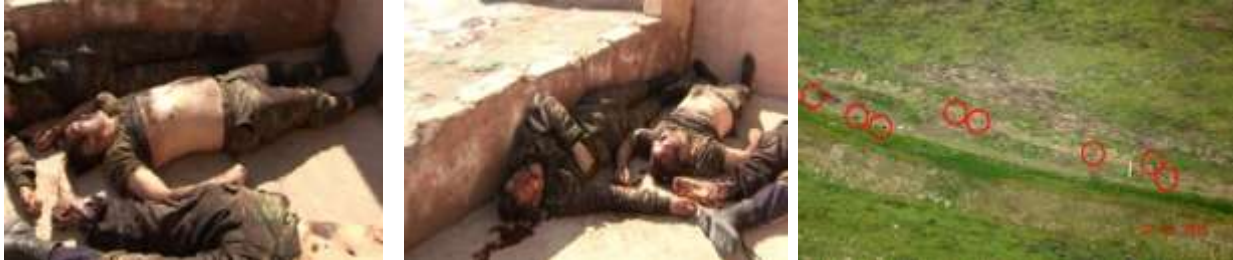
Azeri Killed terrorists

We praise the defense ministry of Kharabagh and valiant border soldiers who not only defended the homeland but repealed and killed and wounded more than 200 Azeri terrorist, with NO MILITARY INIFORMS, downed 2 MI 24 helicopters, a tank and a drone. See Photos